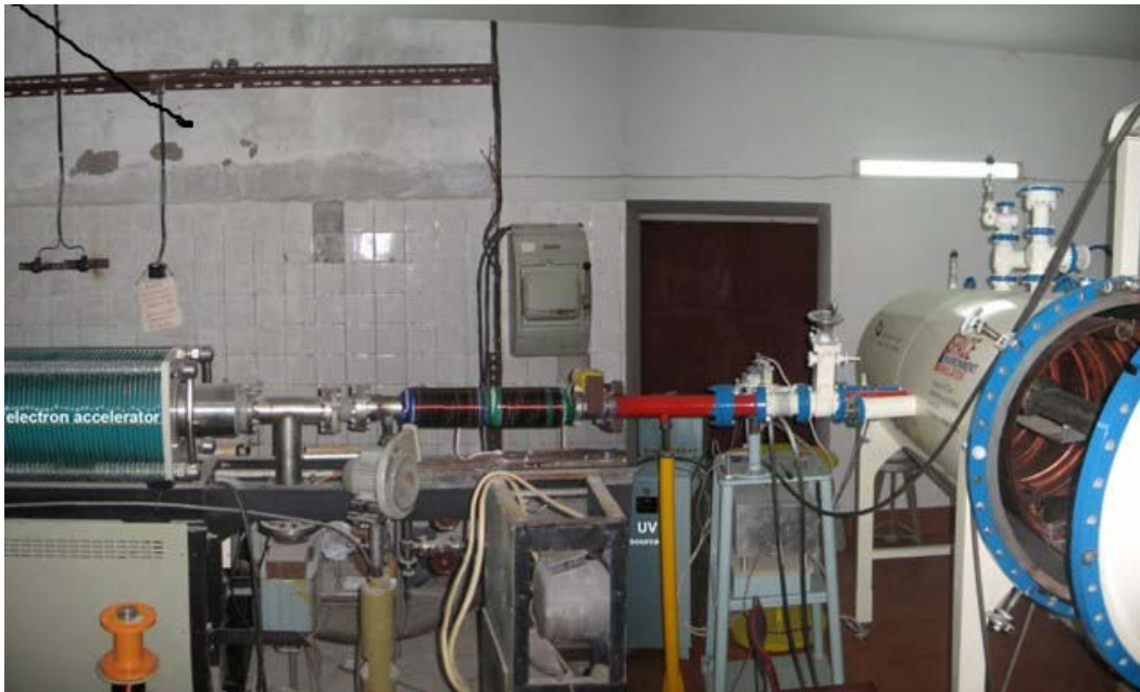
Connection of space environment simulator (SES) with electron accelerator Photo 2.